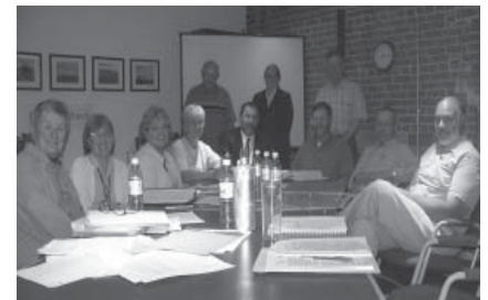
LLT Board at work!